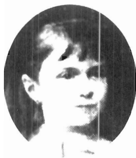
Alexandra Kollontai, aged 5