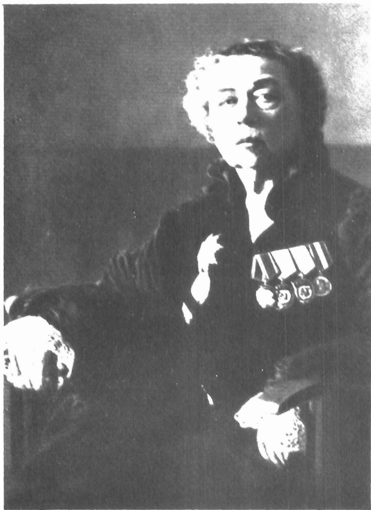
January 1952, two months before her death