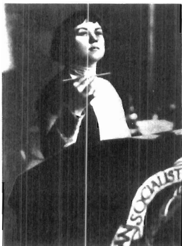
Speaking at the 2nd International Conference of Communist Women, June 1921