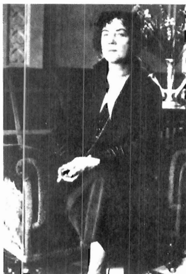
On a business trip to London, 1925