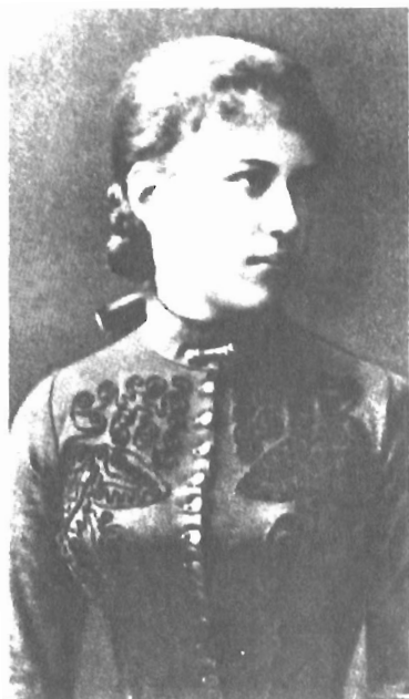
Alexandra Kollontai, aged 16