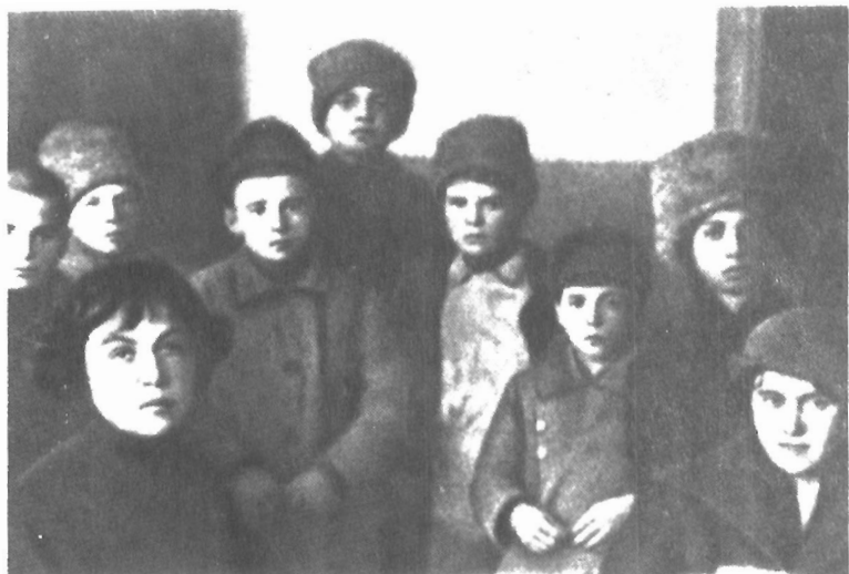
Alexandra Kollontai surrounded by waifs in her commissariat, Petrograd early 1918