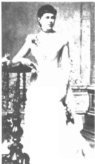
Aged 17, as a debutante in her first ball dress