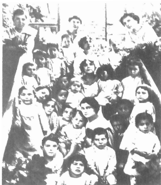
Alexandra Kollontai (top row, centre) in a children's home named after her, during the evacuation of Kiev, 1919