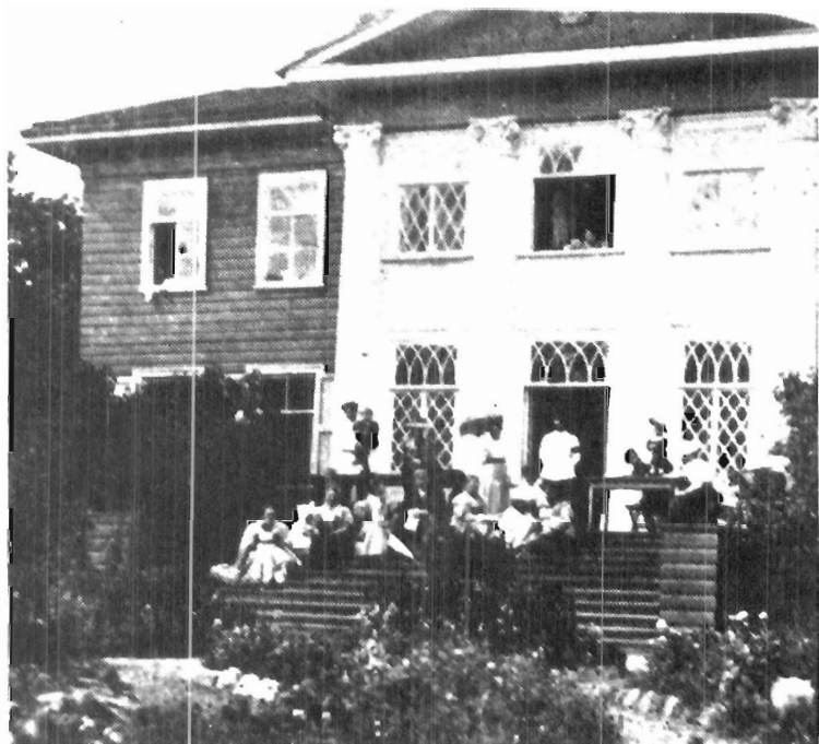
Family and friends at the Kuusa estate in Finland, 1895