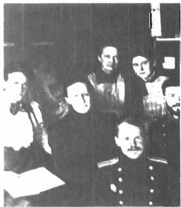
Alexandra Kollontai (extreme left) sitting beside Elena Stasova at the Rubakin Museum