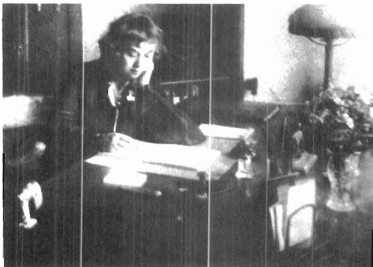
In her office in Stockholm, 1932