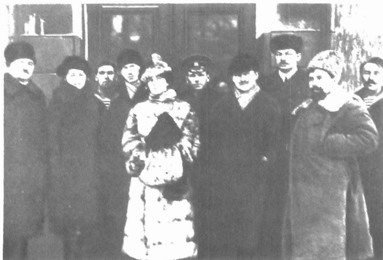
Alexandra Kollontai and Pavel Dybenko with a delegation of Scandinavians Petrograd, 1918