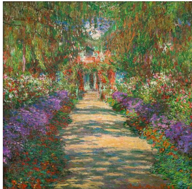
Une Allée du jardin de Monet, Giverny (1902) by Claude Monet .

Ἐμφυτος πᾶσιν ἀνθρώποις ὁ τῆς ἐλευθερίας πόθος. Διονύσιος ο Αλικαρνασσεύς , Αρχαίος Ἑλληνας ιστοριογράφος, 1ος αἰών π.Χ.,