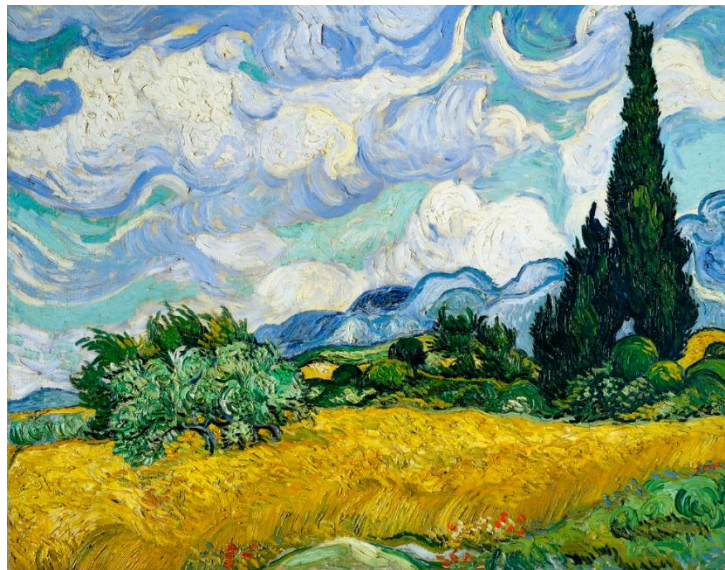
Wheat Field with Cypresses (1889) by Vincent Van Gogh .

Πηγές εικόνων πενταγράμμου: https://www.vectorstock.com/royalty-free-vector/set-musical-staff-various-musical-notes-on-stave-vector-17879623 , https://gr.pinterest.com/pin/148970700144311172/